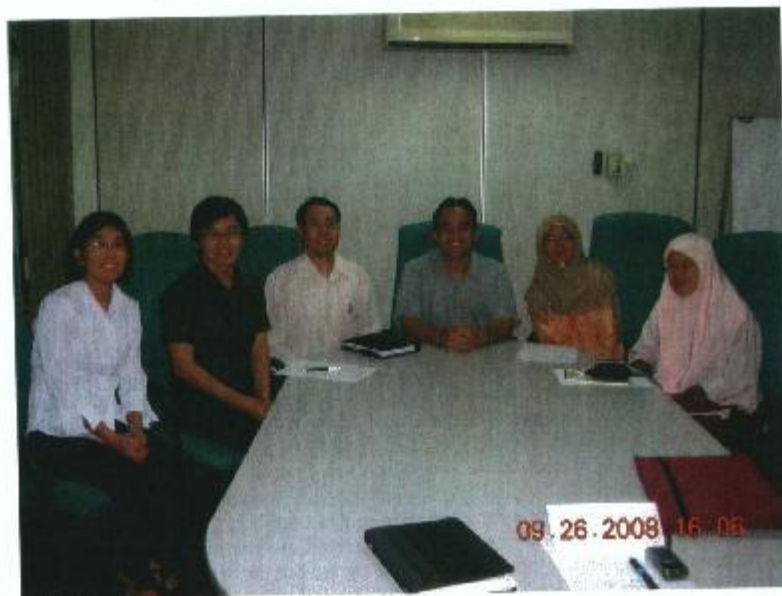
One for the album...picture of G&S Committee 2008/2009