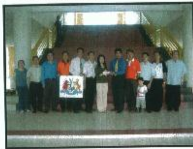
Donation to Sibu Kidney Foundation