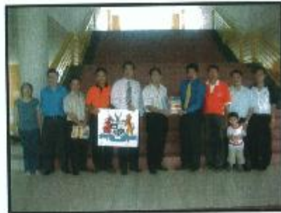
Donation to Kolej Bersatu Sarawak